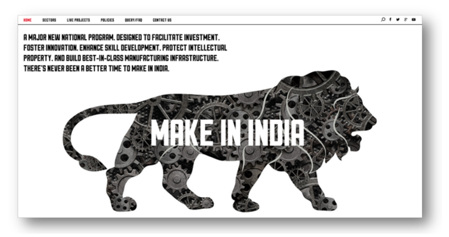
The New "Make in India" Campaign Website

In September 2014, India's Prime Minister Narendra Modi announced the "Make in India" manufacturing campaign. The goal of the campaign is to try to increase the manufacturing share of Indian economy by encouraging domestic and foreign investors to set up operations in the country, whether for export or for the domestic market.